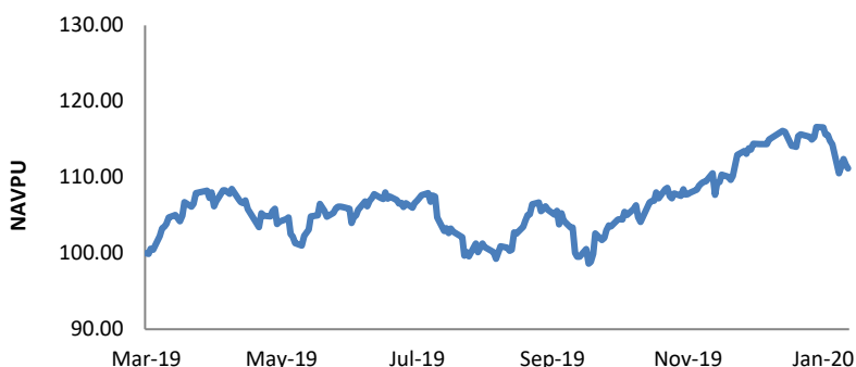
Figures as of 1.31.2020